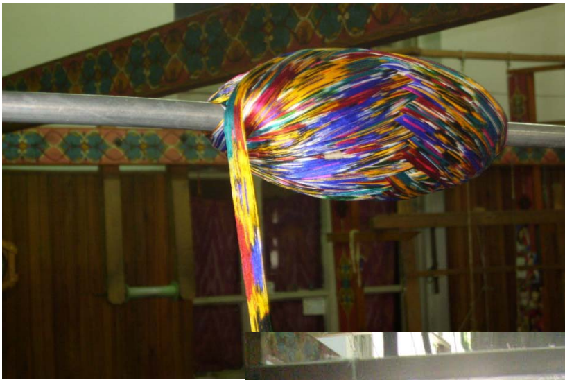
fruit of the silk -loom