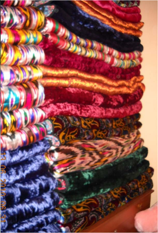
silk – street – street – silk, Daily in tradition