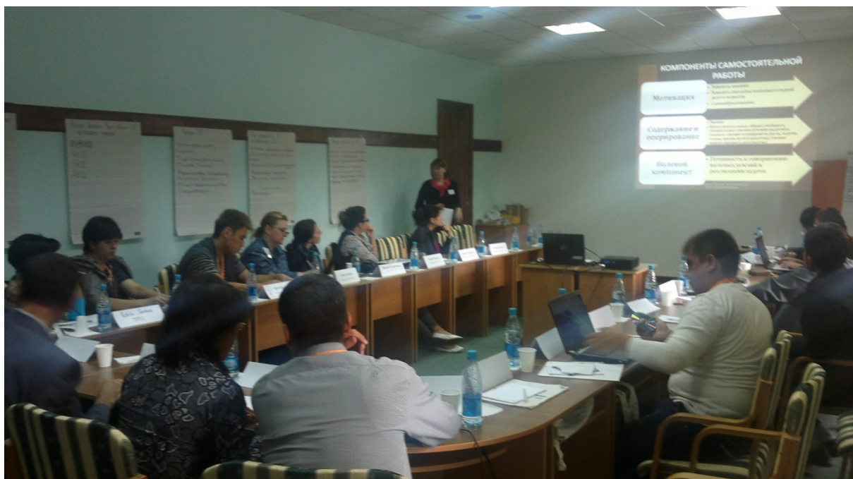
Presentation: “Self study”