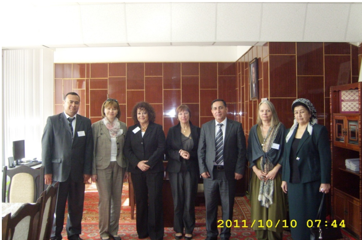
Welcome of the host institute: Tashkent Institute of textile and light industry