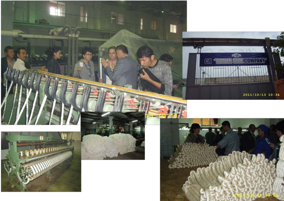
Study trip to Silk processing factory «Silver Silk» in Tashkent